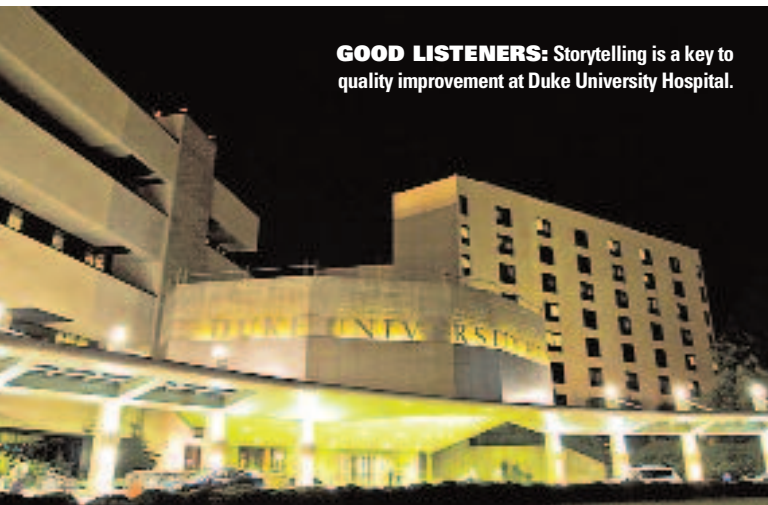
GOOD LISTENERS: Storytelling is a key to quality improvement at Duke University Hospital.

Each hospital unit contains a storyboard that highlights balanced scorecard results, helping to drive performance improvement. The data is also published monthly on an employee intranet site.